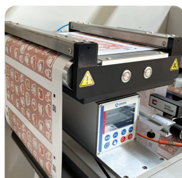
Auto Deviation Correction