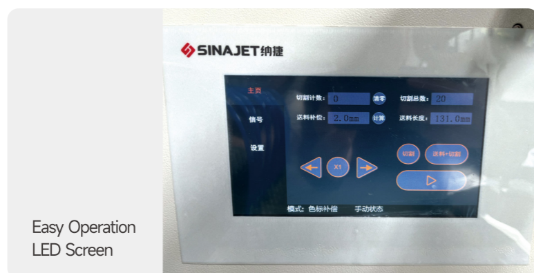
Easy Operation LED Screen