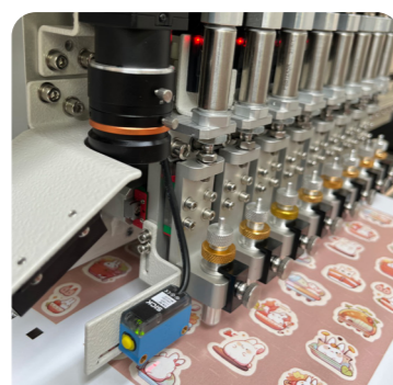
Multi Cutting Tools +CCD Reading QR Code+ Colour Code Sensor